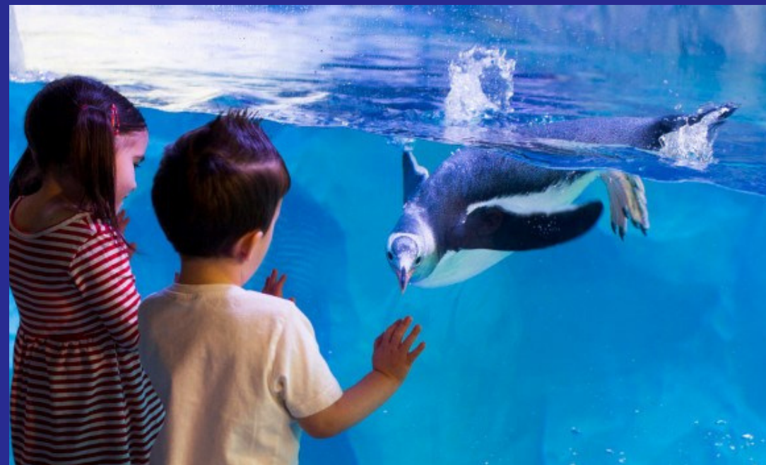
Lots of water and blue lights