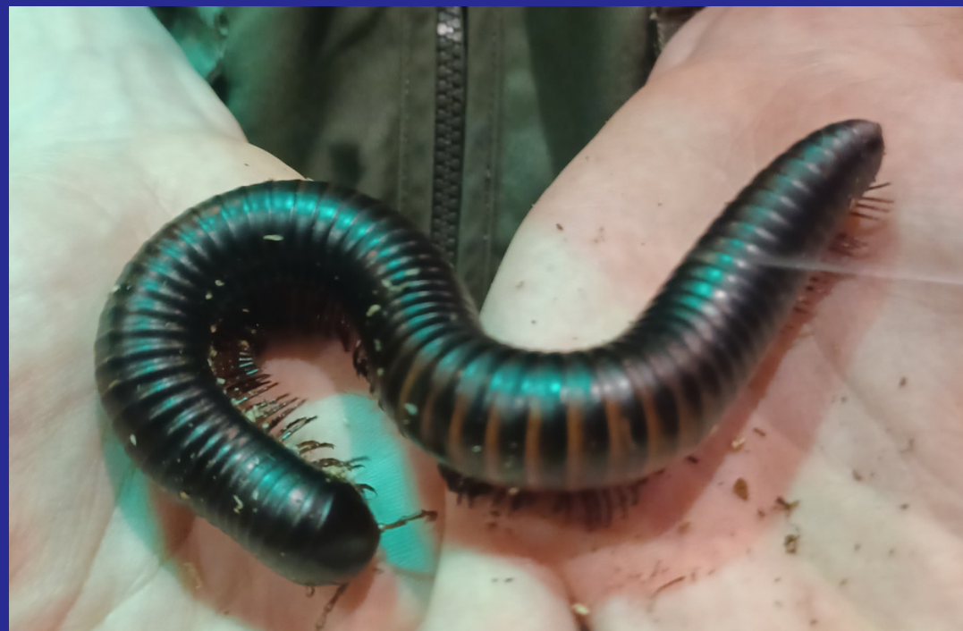
Beetles and insects (if you want to)