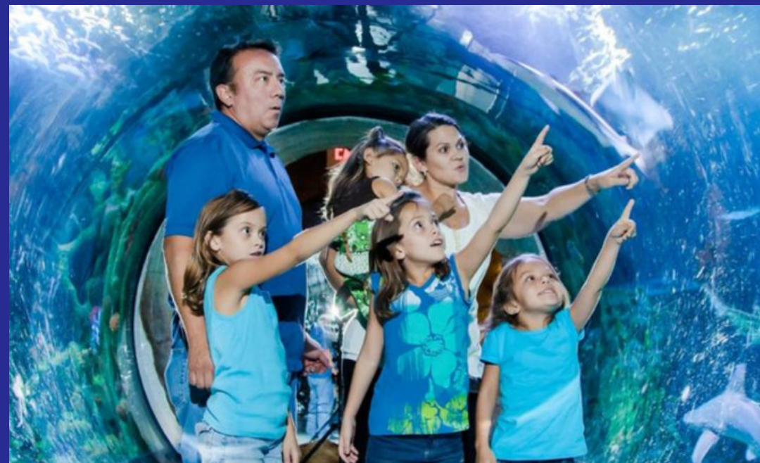
The sound of other children