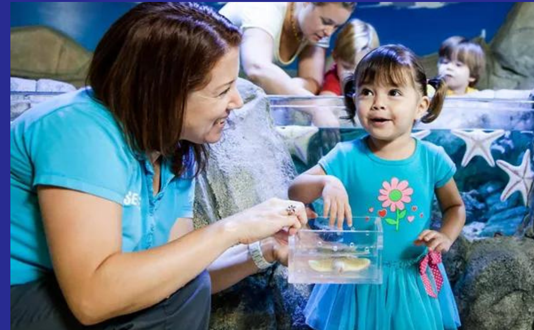
A starfish (if you want to)