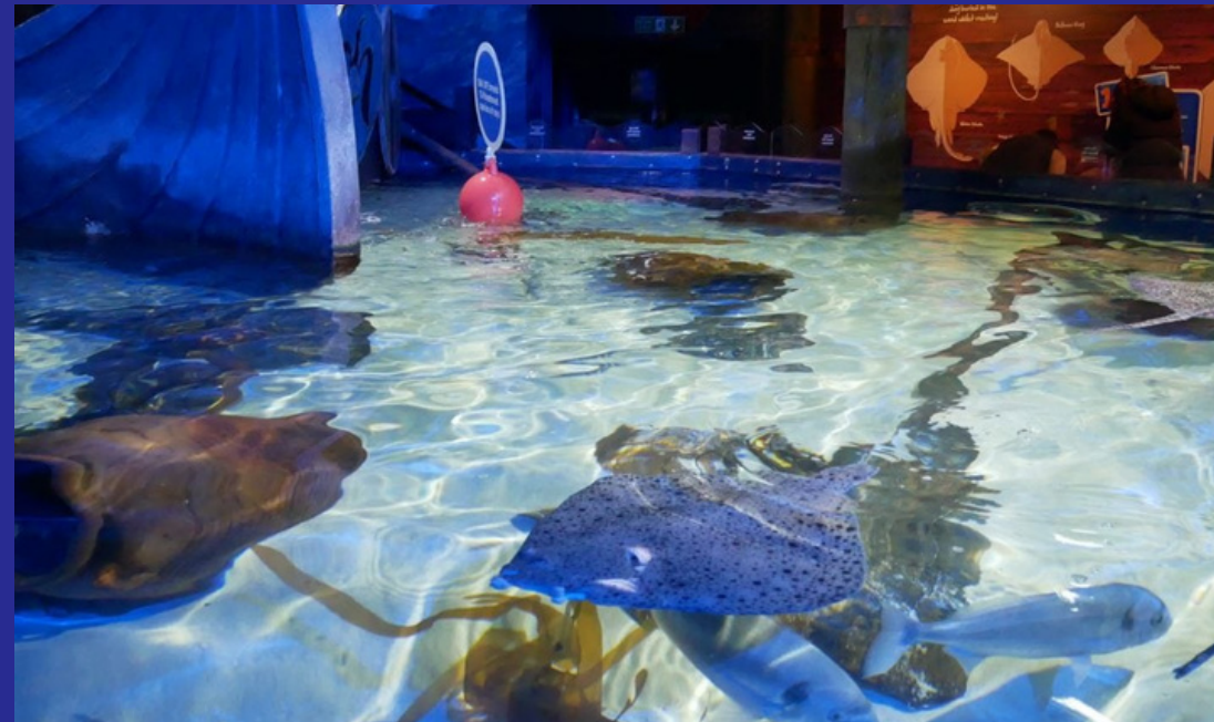
A seaside smell (shells)