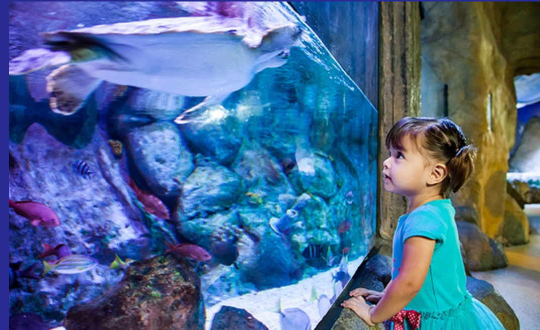
The sound of water