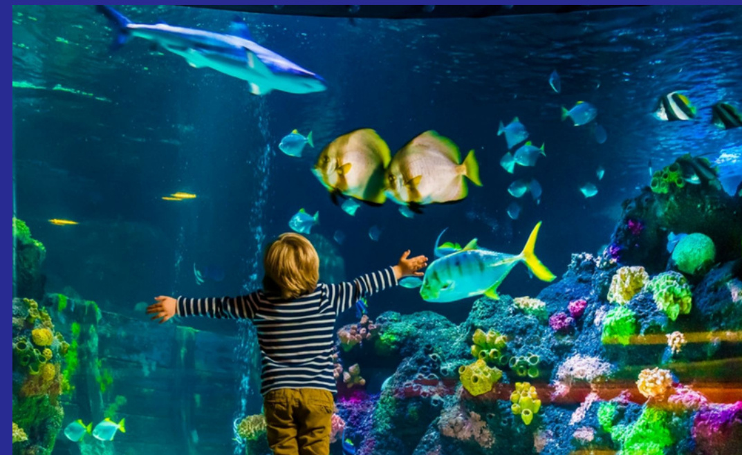
Soft background music