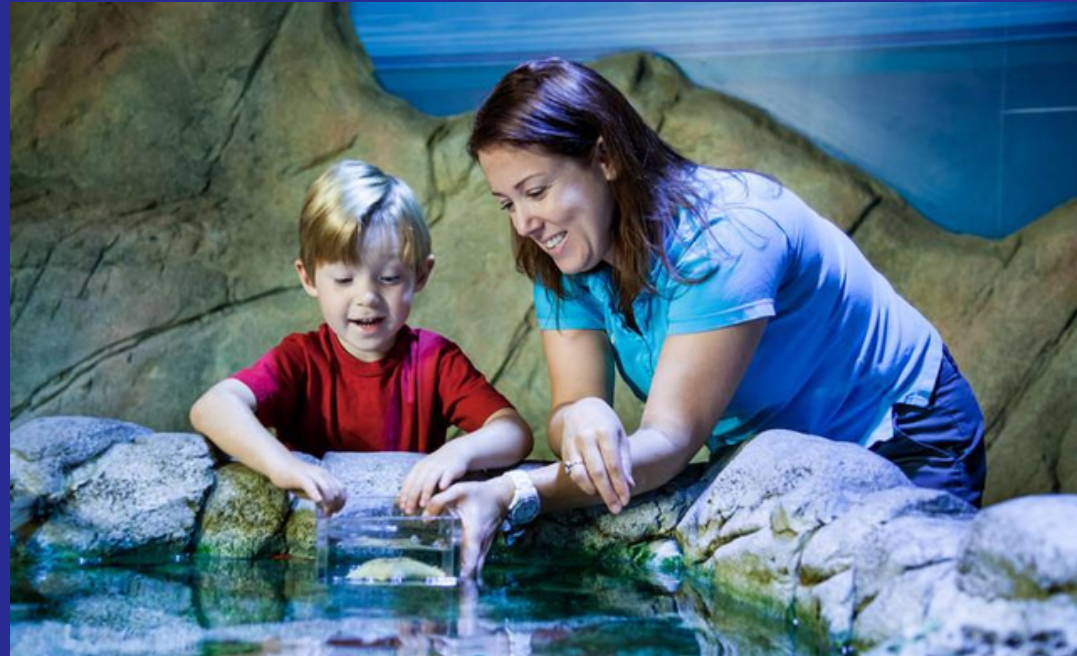
Cold water in the touchpool