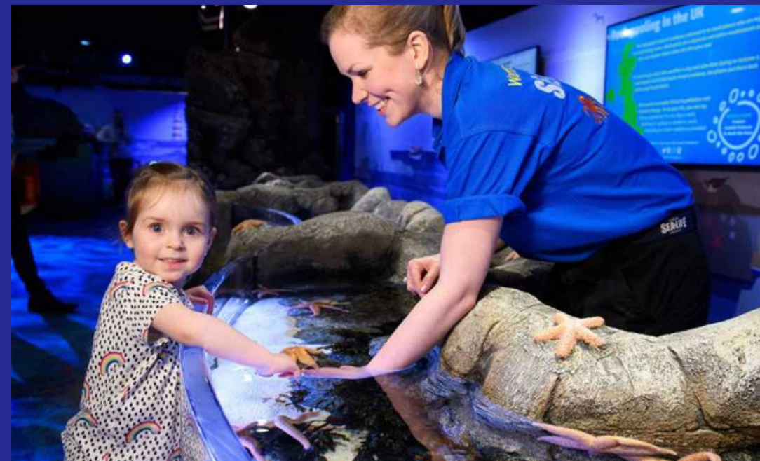
A rockpool area