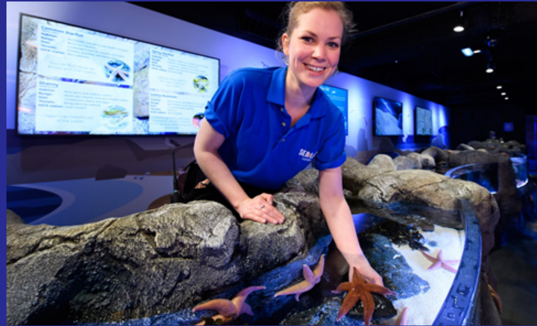
A team member talking