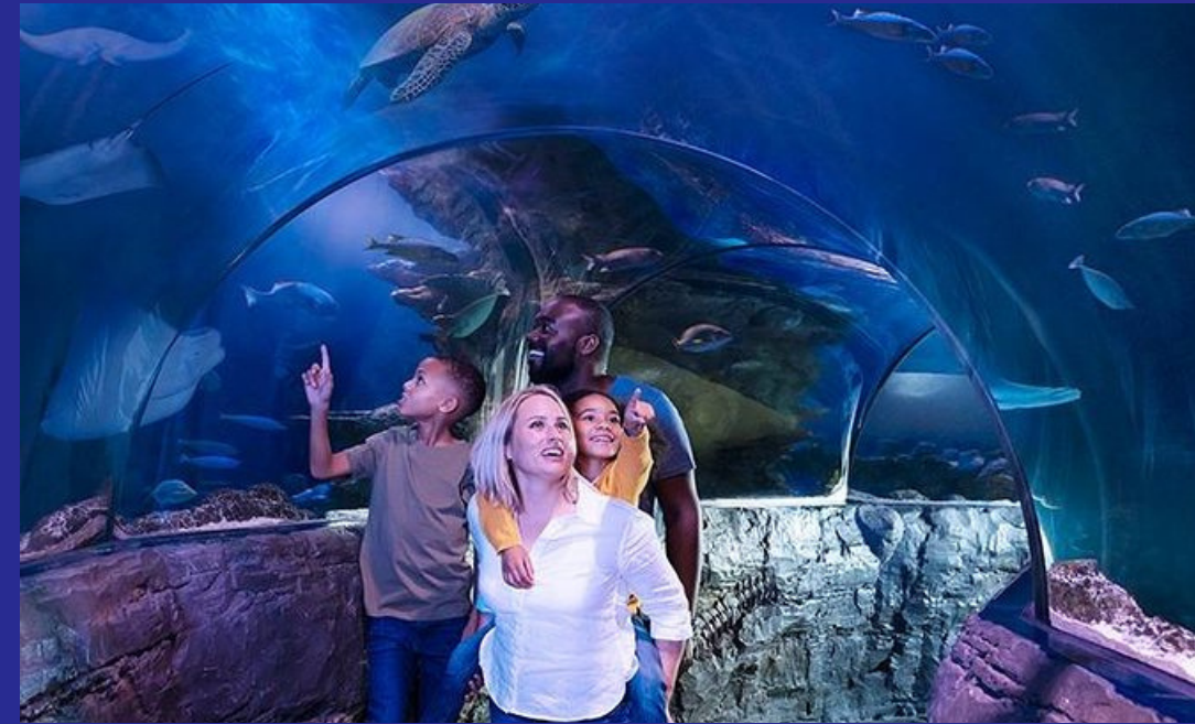
A tunnel you can walk through