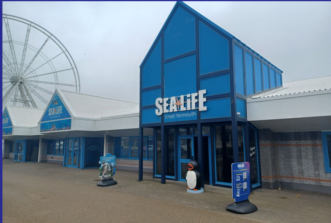
A big blue entrance

When I visit the SEA LIFE Centre, outside I might see