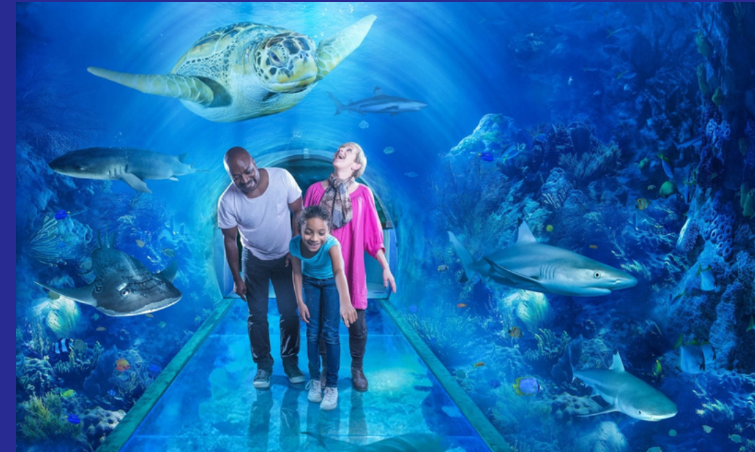
The fish and animals